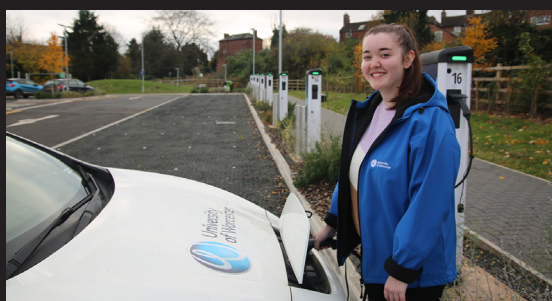
Severn Campus has more than 100 EV charging points

A LOOK BACK AT SOME OF THE ACHIEVEMENTS AND CELEBRATIONS OF THE LAST YEAR