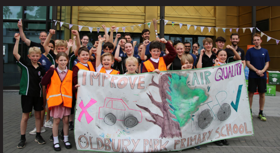
The Running Out of Time Climate Relay made a stop at the University